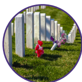
Arlington National Cemetery