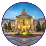
Colorado State Capitol