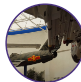
National Air and Space Museum