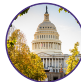
United States Capitol